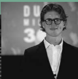
LUCIAAN GROENIER FILM FOR OUR FUTURE