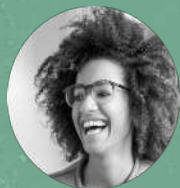
HARRIËT MBONJANI EYE FILM MUSEUM